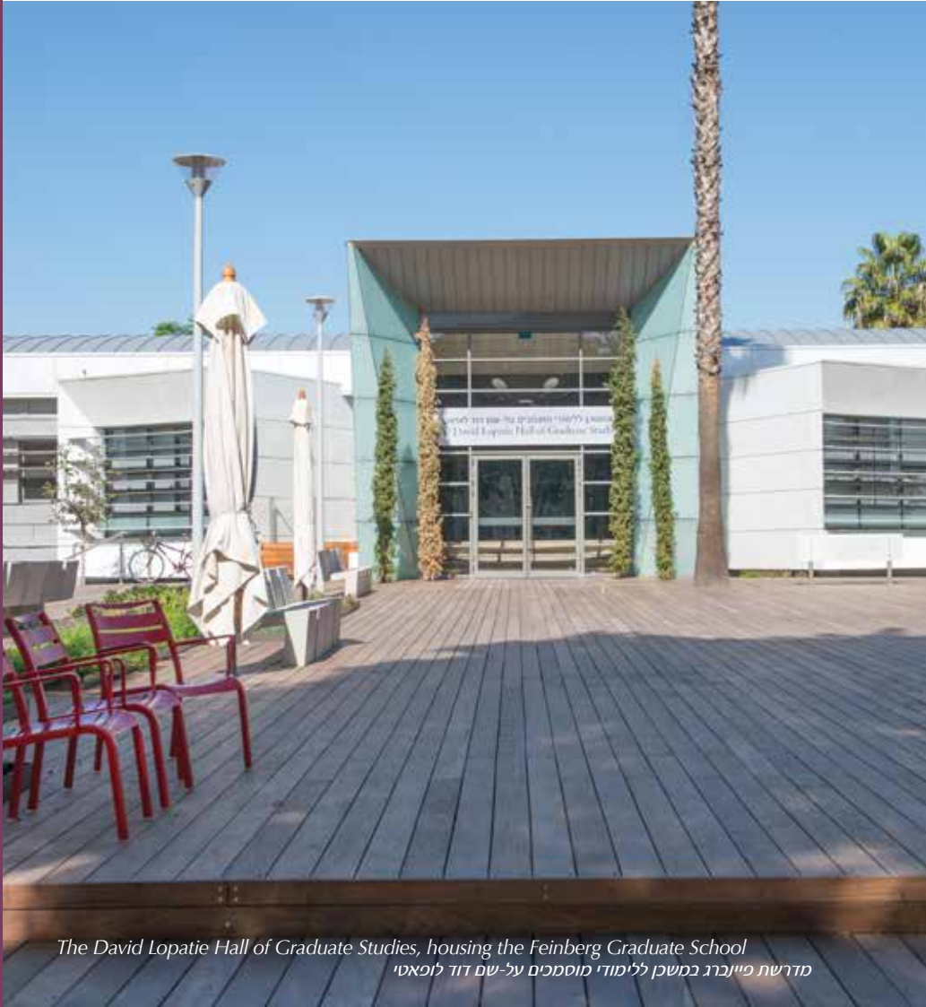
The David Lopatie Hall of Graduate Studies, housing the Feinberg Graduate School מדרשת פייןברג למחקר וללימודי מוסמכים על-שם דוד לופאטי